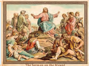
The Sermon on the Mount

If everybody were to follow the Beatitudes the world would be very near to perfect and there would be no violence, no troubles, no war, no harm to the world at all.