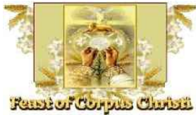
Feast of Corpus Christi