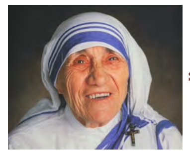
"GOD has not called me to be SUCCESSFUL. He called me to be FAITHFUL."